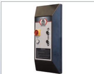
Secondary control panel on second column