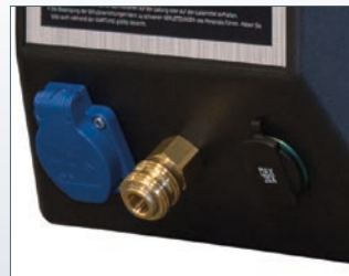
"Energy-Set" (230V / 12V / compressed air jack)