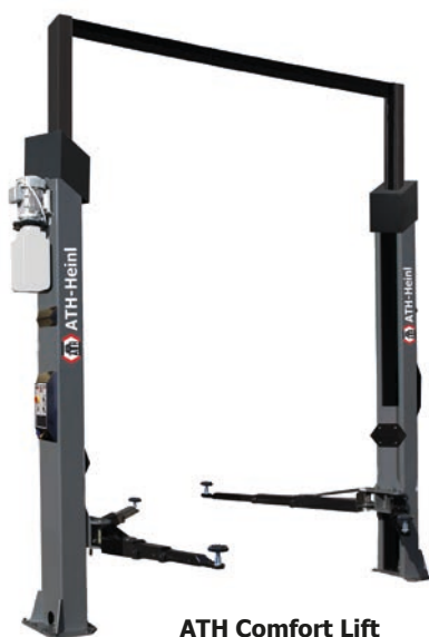
ATH Comfort Lift (L-model)