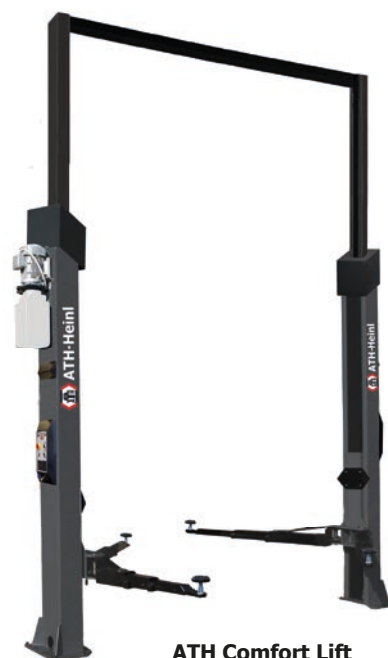
ATH Comfort Lift (X-model)