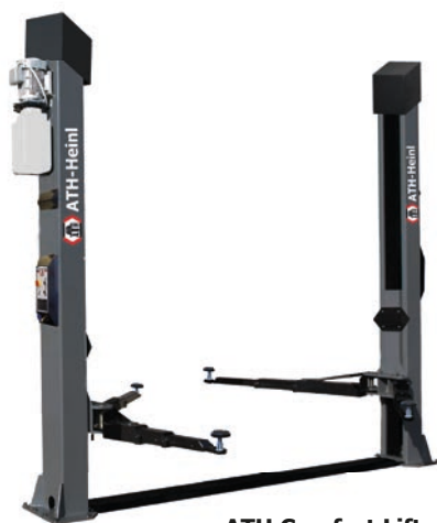
ATH Comfort Lift